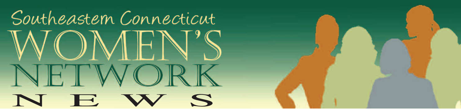
Volume 33, Number 8, June 2020